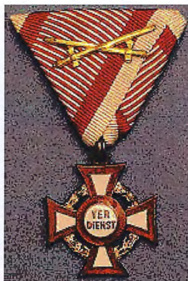
The Cross of Military Merit of the Austrian-Hungarian Empire

He once told me that the sound of the horses was the most terrible, fearful sound he had ever heard. "It is the sound of hell itself," he said.