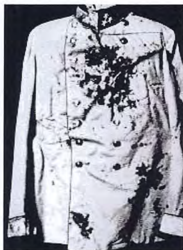
The blood-stained tunic worn by Archduke Ferdinand when he was shot by a Serbian assassin.

I also recall how hushed, almost reverential, he became in the museum when we came to the thirty-two horsepower, four cylinder 1910 Graft and Sift open car in which Archduke Franz Ferdinand, the heir to the Habsburg dynasty and the throne of the Austrian Hungarian Empire, was