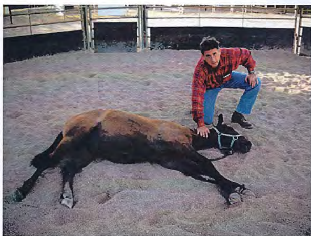
Author with his new 6 month-old Lipizzan colt "Teddy"—three generations in the making. "Teddy" continues to prove that Lipizzans are still among the most intelligent, willing horses in the world.

I spent the first eight weeks of the colt's life hobbling around on crutches. I named him Teddy, in honor of Theodore Roosevelt. In a very concrete way, Teddy (aka Pluto Santana) and I have, well, gotten off on the right foot. We had to---my left was in a cast. My bones were healing. As I hobbled around the round pen, I noticed my limited mobility had helped me place more emphasis on my colt's training in close quarters. I had to be sure I stayed aware not just of the colt's responses but, in order to keep the dam at ease, I had to also work with her significant, looming presence close at hand. I learned to incorporate a little circling time in the round pen as part our daily training regimen. It gave everyone a nice start with a chance for mother and foal to run around the arena—sometimes at a full enthusiastic tilt. I was always amused