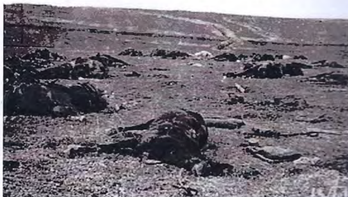
Nearly four million horses are estimated to have died during World War I.