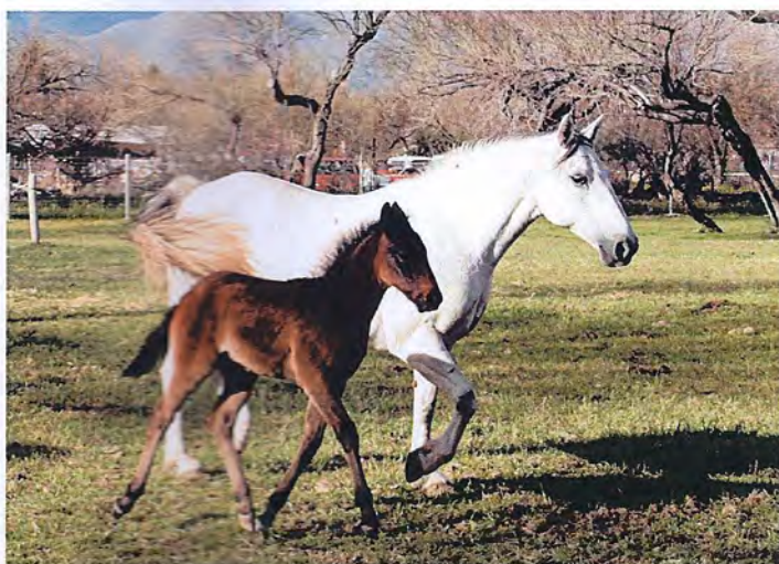
Dam Santana with her new colt, "Teddy" (aka Pluto Santana I) three days after being born.

For a moment, it occurred to me, the dam might try to kill me outright but, just as suddenly as she erupted, she now seemed perfectly tranquil. I would say even slightly embarrassed by her outburst. She was only interested in the colt. I managed to safely drag myself out of the stall and eventually get help to get myself to the hospital. My leg was broken in three places. It could have been far worse.