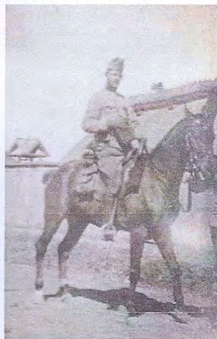
Author's grandfather headed to the front in the opening days of World War I

My grandfather passed on to me his great love for horses and this wonderful breed. He shared with me his perpetual grief at seeing his own horses sacrificed in war. I remember walking with him through the Museum of Military History just outside Vienna when I was a young teenager on vacation. Once we were strolling down one of the halls and he came to a stop in front of a huge oil painting. It was one of those typical immense, baroque paintings that depicted a battle with hundreds of figures, charging bravely through cannon fire. There were heroic generals at the center, bathed in light and