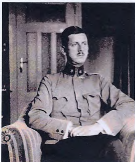
Author's grandfather as an officer in the Imperial Cavalry of the Austrian-Hungarian Empire in Vienna, Austria

Some horses make us wait a lifetime before they're ready to come into this world. But this year, the spring of 2010, we had our first colt out of our Lipizzan breeding program. The events that shaped his arrival spanned three lifetimes, reaching across a century of my family's history from Vienna, Austria to Tucson, Arizona. After all that, the colt almost got me killed.