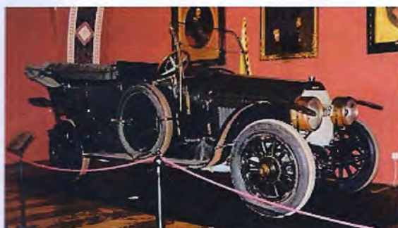
The automobile in which the Archduke Ferdinand, heir to the throne of the Habsburg Empire, was assassinated. His death would ultimately spark the outbreak of World War I

"It is a great sin for men to seek to kill each other with their sabers, their bullets, and their shells. That's a matter between