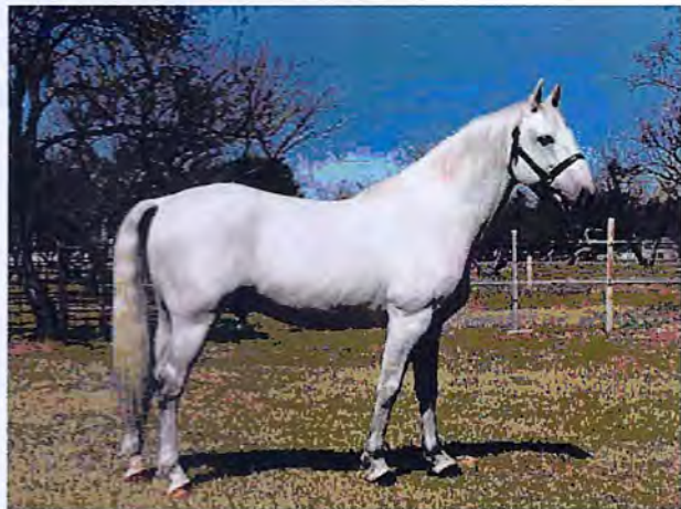
Foundation stallion, Pluto Gisella II.

We had a beautiful indoor stall, equipped with cameras, fresh straw, five-star equine rating. I thought to myself: "I'll be damned if I'm going to lose my first colt!" But there was