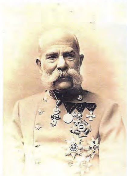
The Emperor Franz Josef