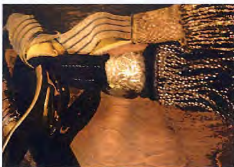
My Grandfather's cavalry saber; the black tassel was worn by all the officers in the cavalry regiments assigned to the funeral procession of the assassinated Archduke Ferdinand. The double-headed eagle of the Imperial Coat of Arms of the Habsburgs is seen below on the knuckle guard.

men, at least," he said. "But to unleash our murderous ways on these innocents, these beautiful, peace-loving animals—to drag them into our hatreds. Our nationalistic struggles. Our ethnic grudges. Our great causes. That is a far greater wrong. For they have no wish to be a part of it nor is it of their making. We visit our sins on horses, polluting their flawless hearts with humanity's atrocities and hatred. There must be no greater sin in the eyes of God."